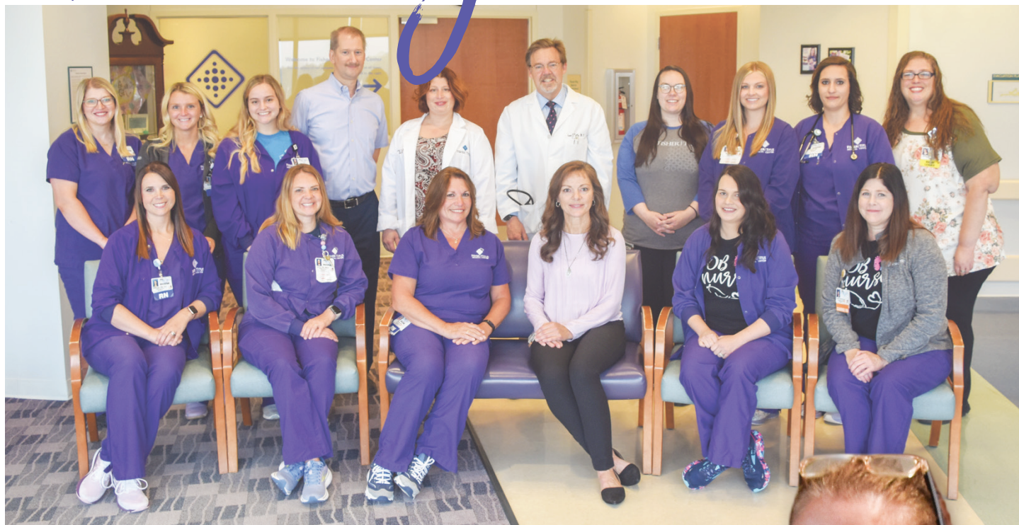
Fisher-Titus OB-GYN staff.

Having a child is one of the most special and challenging moments of anyone's life. That's why families who are delivering should be able to trust that their care is prioritized and of the highest quality. At Fisher-Titus, you will find an experienced and compassionate staff that are ready to give you that care.