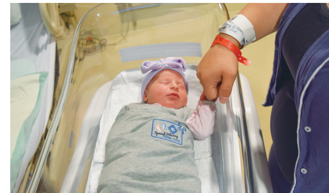
Newborn bassinets were funded by generous donor gifts made to the Fisher-Titus Foundation.