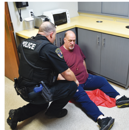
MCI and ALICE training held at Janotta & Herner in Monroeville.